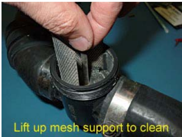
Any particles larger than the holes in the stainless steel mesh will be caught.