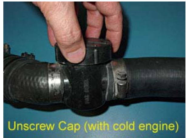
It's the simplest and quickest filter to clean with absolutely no tools required.

Kit also includes: 2 grades of Filter screens 2 Quality hose clamps 1 spare O-Ring seal