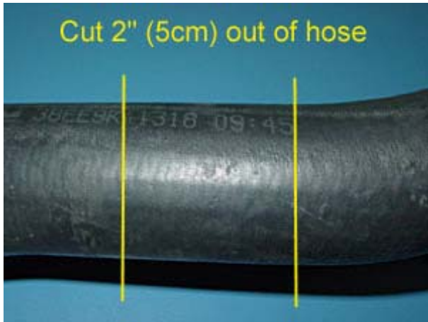
Along a straight section of the top radiator hose, mark 2" (5cm) ready for cutting.

Thank you for purchasing the 1¼ inch Tefba coolant filter from FasterJags™ for your XJS. We feel that it is the finest product of its kind available anywhere. Installation is very simple, as illustrated in the photos below.