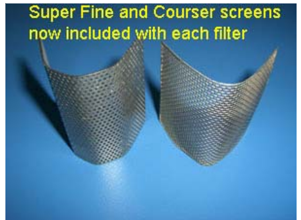
When first fitted, check regularly for debris until minimal amounts are trapped.

If you have any questions regarding Tefba filters or any other XJS related product, please email brian@fasterjags.com or call Brian Welker at 214-769-4555.